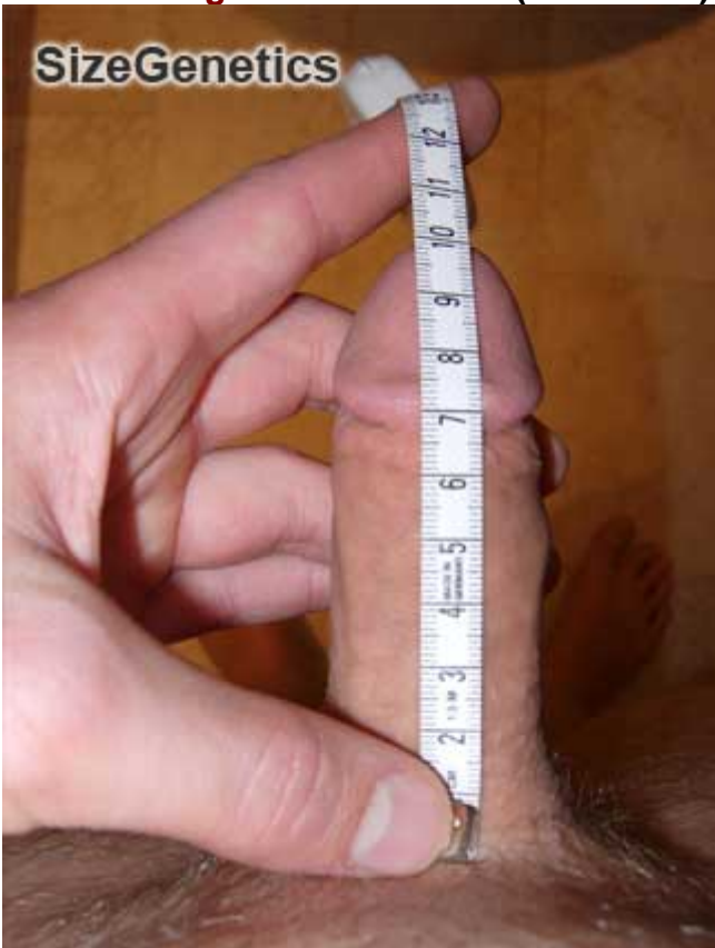
Flaccid Length Before: 10 cm (3.9 inches)